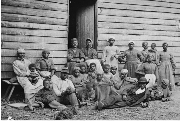
[Cumberland Landing, Va. Group of "contrabands" at Foller's house] [1862 May 14]

Confederate supporters made up the majority of white women in Middle and West Tennessee, and they often let Union occupation troops know in no uncertain terms that they were not welcome. Other Confederate women enjoyed conversing and debating with Union officers, even as they remained true to the Confederate cause. Still others went over to the other side and fell in love with Yankees. In East Tennessee, many women supported the Union and chafed under Confederate rule until Union troops arrived late in 1863.