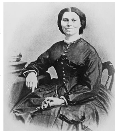
Clara Barton. A war time photograph [between ca. 1890 and 1910]

While major fighting usually only came to communities for a short time, occupation forces often remained. In divided states such as Tennessee, women had mixed reactions to occupation forces.